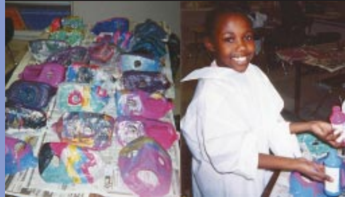
THE MASKS ARE THEN PAINTED BY THE CHILDREN